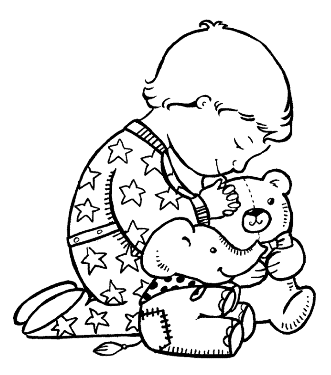
God Hears and Answers Prayer